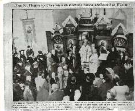
1947 - 20th Anniversary Congregation 1947 - 15th Jubilee Of Lesia Ukrainka Organization 1947 - Blessing Of Church On Seminole