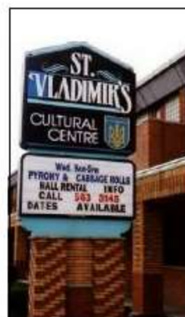
1989 - Phase I Renovations - Cultural Centre