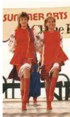
1987 - 60th Anniversary Congregation