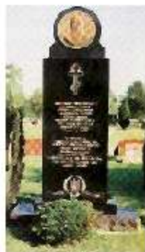
1981 - May 2 - Blessing Of Cemetery Monument