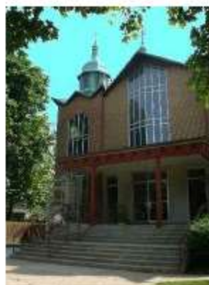
1986 - Church Marker Donated By Lesia Ukrainka