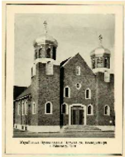
1945 - Church Built On Seminole Street